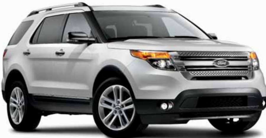
White Platinum Metallic Tri-coat.