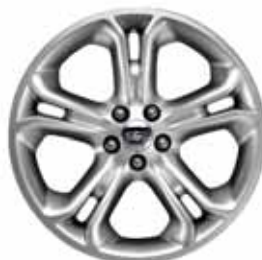
20" Painted Aluminum Standard