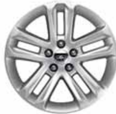
18" Painted Aluminum Standard