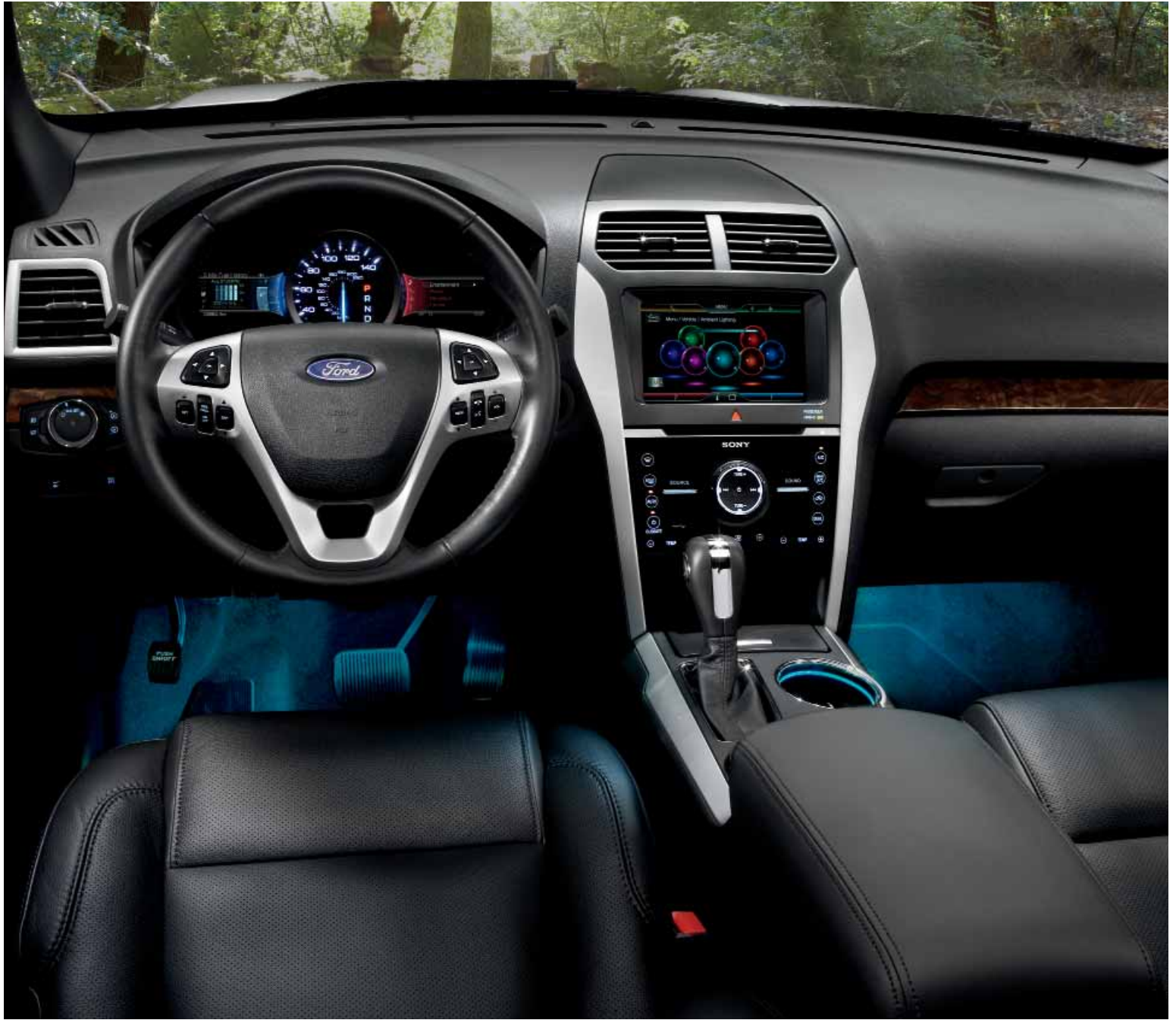
Charcoal Black leather trim with perforated inserts. Available equipment. | 2nd-row center console 1 | Intelligent Access with push-button start. | Body-color grille. | 2nd-row climate control, 12-volt powerpoint and 110-volt power outlet.