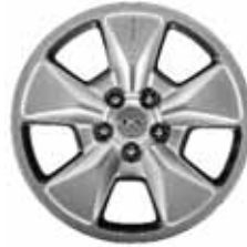
17" Steel with 5-spoke Wheel Covers Standard