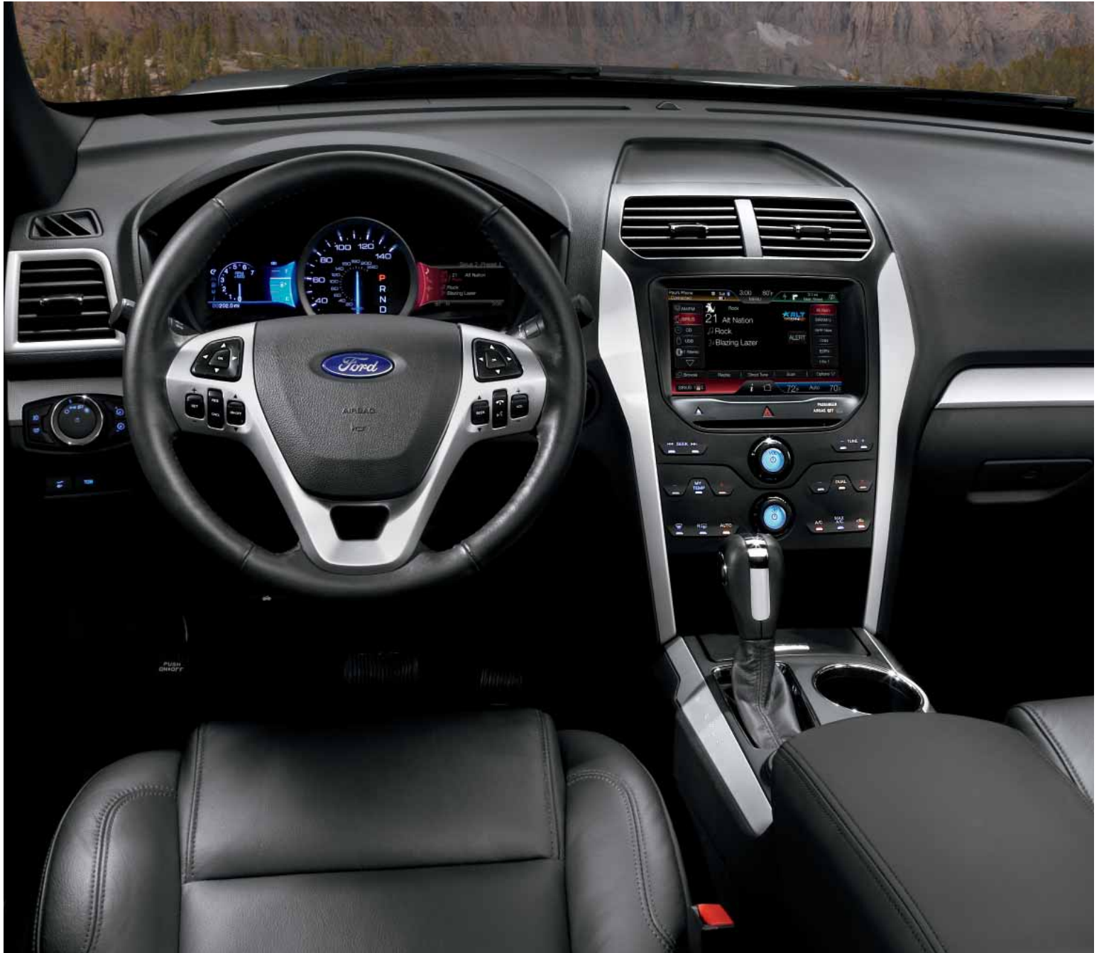
Charcoal Black leather trim. Available equipment. | 1st-row center floor console. Available equipment. | Heated sideview mirrors with LED turn signal indicators and security approach lamps. | Satin Silver-finish grille. | Fog lamps.