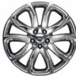
20" Polished Aluminum Available