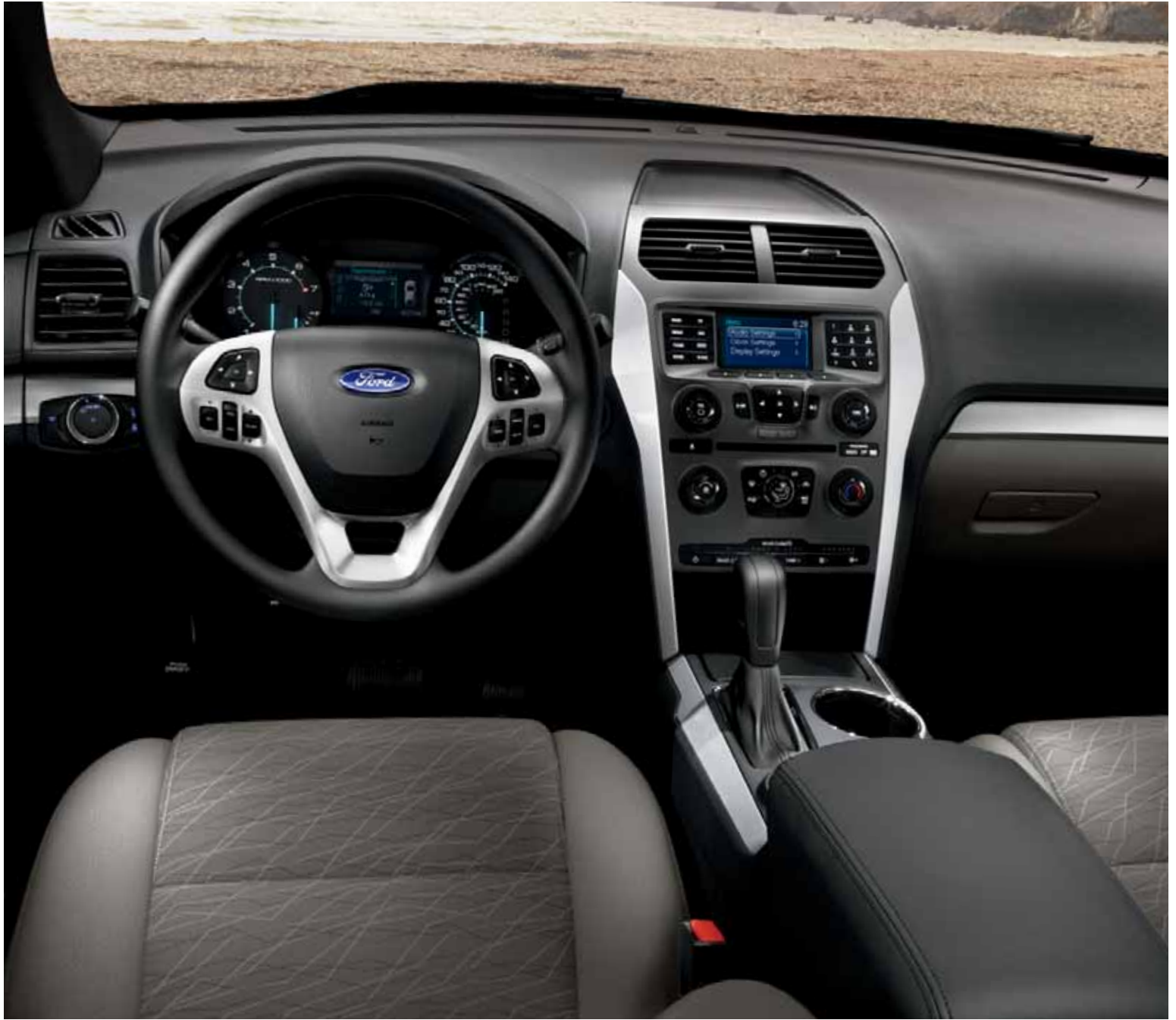
Medium Light Stone cloth trim. | 3rd-row cupholders and storage bins. | MyFord™ 4.2" LCD center stack display. | Embossed door-sill scuff plates. | All-weather floor mats 1