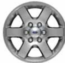
17" Aluminum Optional