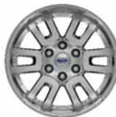
18" Machined Aluminum Standard