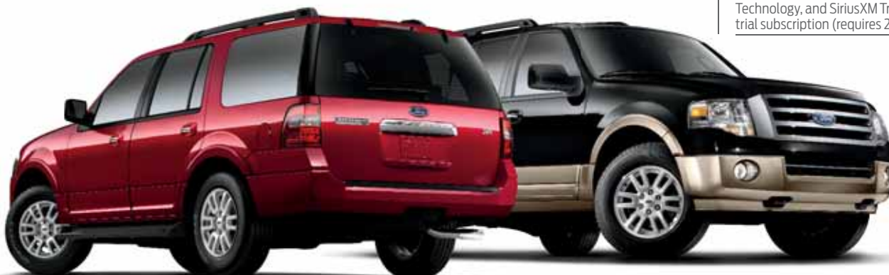
XLT. Ruby Red Metallic Tinted Clearcoat. XLT Premium EL. Tuxedo Black Metallic. Available equipment.