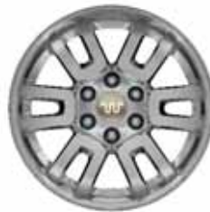
18" Machined Aluminum with King Ranch Center Caps Standard