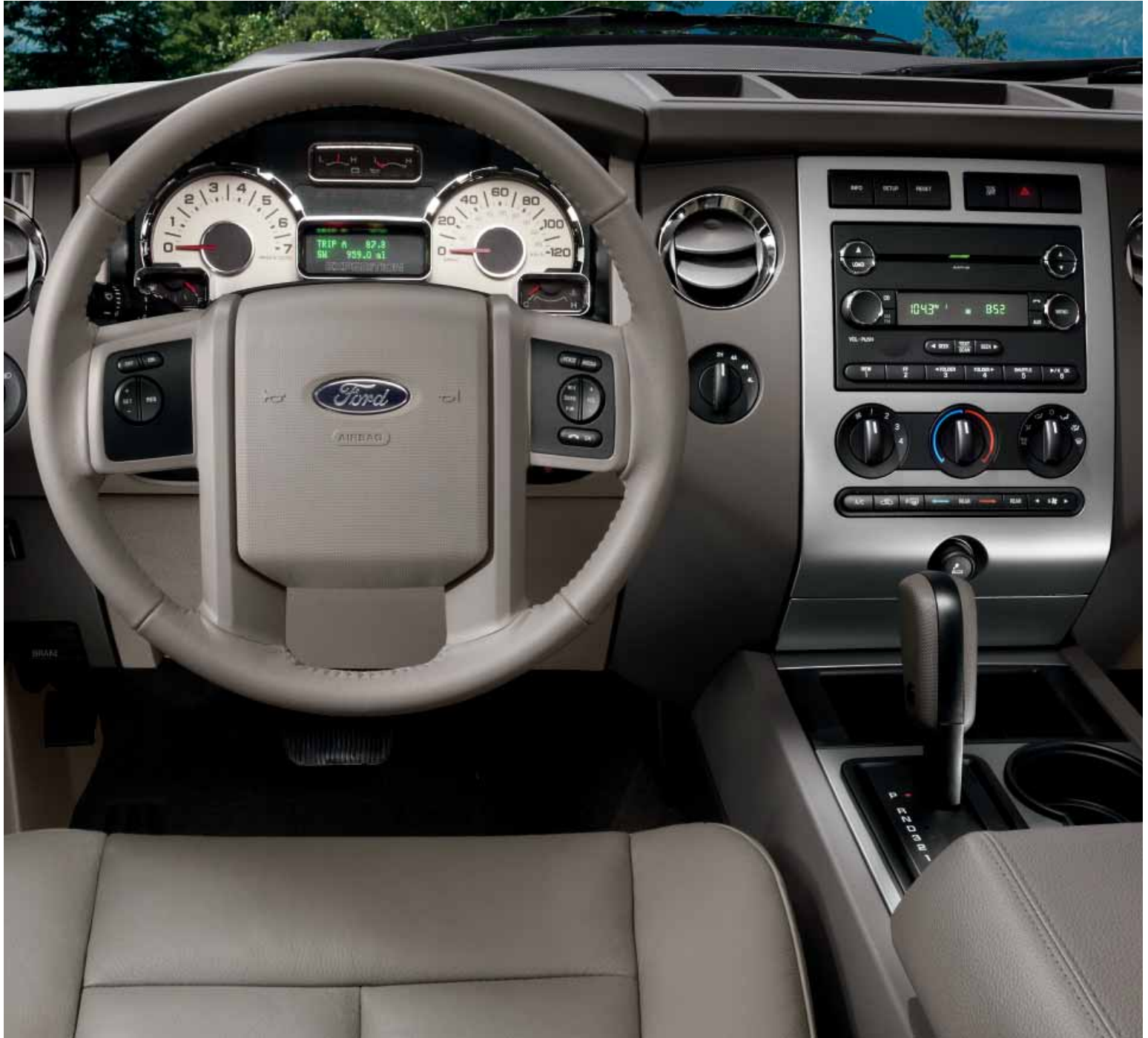
XLT. Stone leather trim. Available equipment. | XLT. Power rear quarter windows. | XLT Premium. 110-volt power outlet. | XLT Premium. Rear view camera. Navigation System 1