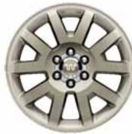
20" Premium Painted Aluminum with King Ranch Center Caps Optional