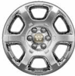
20" Chrome-Clad Aluminum with King Ranch Center Caps Optional