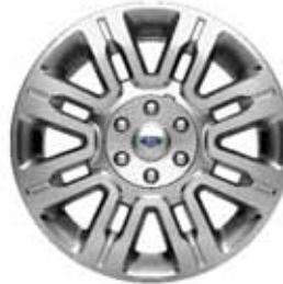
20" Polished Aluminum Optional