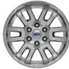
18" Machined Aluminum Standard