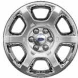
20" Chrome-Clad Aluminum Optional