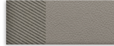
3 Medium Light Stone Partial Leather