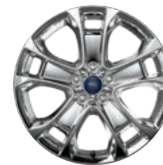
18" Chrome Alloy Finish Available: SE