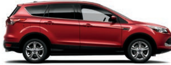
Ruby Red Metallic Tinted Clearcoat