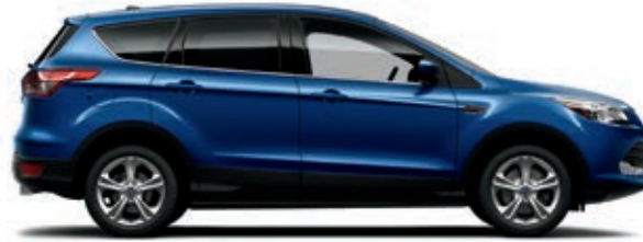
Deep Impact Blue*