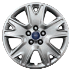
17" Steel with Sparkle Silver-Painted Wheel Covers Standard: S