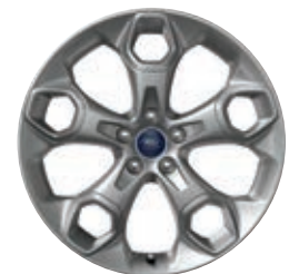
19" Premium Luster Nickel-Painted Aluminum Optional