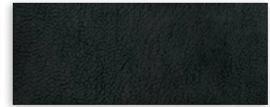
6 Charcoal Black Leather