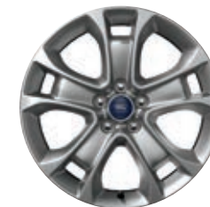
18" Sparkle Nickel-Painted Aluminum Standard

High-intensity discharge (HID) headlamps!*