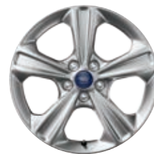
17" Sparkle Silver-Painted Aluminum Optional: S; Standard: SE