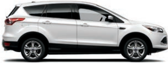
White Platinum Metallic Tri-coat