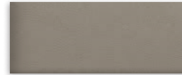
5 Medium Light Stone Leather