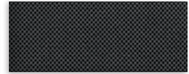
2 Charcoal Black Cloth