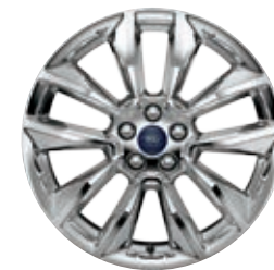
19" Chrome-Like Alloy Finish Included: Chrome Package on SE