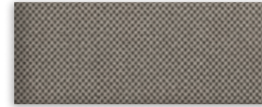
1 Medium Light Stone Cloth