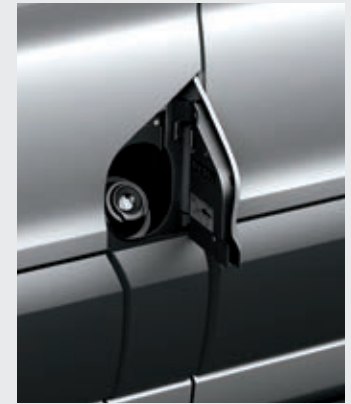
Easy Fuel® capless fuel filler.