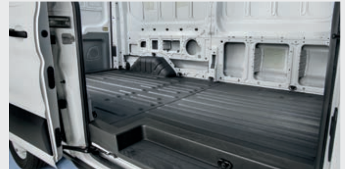
Rear view camera display 1 (top). Tough Bed ® spray-in cargo floor liner 1 (bottom).