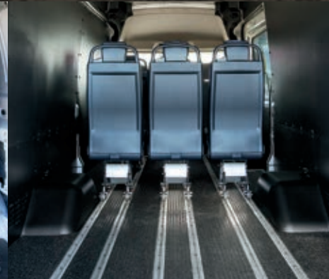
TransitWorks SmartFloor flexible flooring system shown in an HR Van with available equipment.