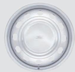
16" White Steel with White Front Hubcap (front wheel shown) Standard: DRW Cutaway & Chassis Cab Optional: DRW Passenger Wagon & Van (Fleet only)