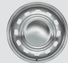
16" Silver Steel with Silver Front Hubcap (front wheel shown) Standard: DRW Passenger Wagon & Van