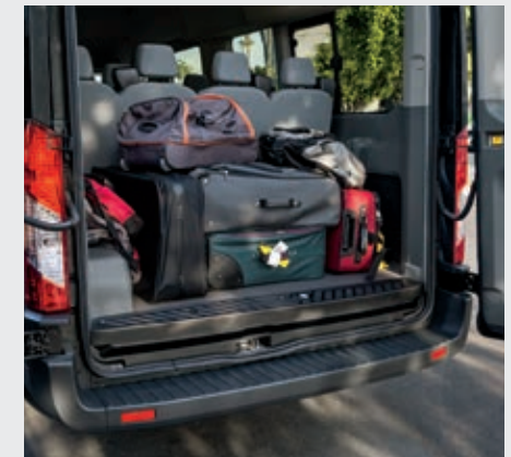
15-passenger XLT HR LWB EL cloth-trimmed interior in Pewter with class-best factory-built cargo capacity and available equipment.