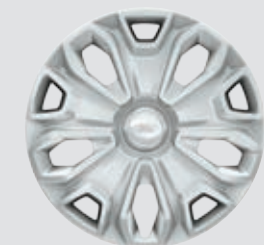
16" Black Steel with Silver-Styled Cover Standard: SRW XLT Passenger Wagon Optional: XL Passenger Wagon, SRW Van, and Cutaway & Chassis Cab