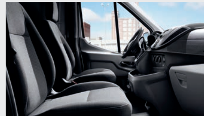
Cloth-trimmed 2 interior in Pewter with user-defined upfitter switches 2 and available equipment.