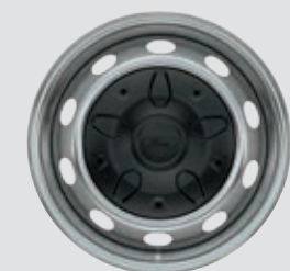
16" Silver Steel with Black Hubcap Standard: XL Passenger Wagon, SRW Van, and Cutaway & Chassis Cab