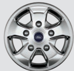
16" Easy-To-Clean Aluminum with Locking Lug Nuts Optional: All SRW (n/a with 9,500 lbs. GVWR or greater)