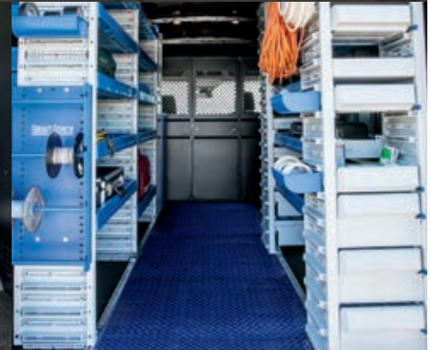
Masterack ® SmartSpace ® General Contractor Package shown in an MR Van with available equipment.