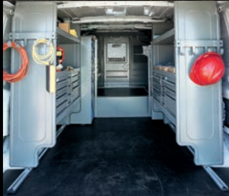
Adrian Steel General Service Cargo Management Package shown in an LR Van with available equipment.