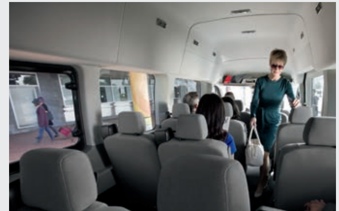
15-passenger XLT HR LWB EL cloth-trimmed interior in Pewter with available equipment.