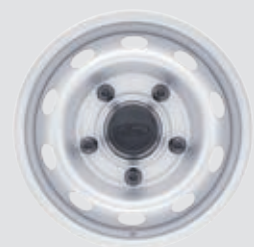
16" White Steel with Mini-Cap and Lug Nut Covers Optional: All SRW (Fleet only)