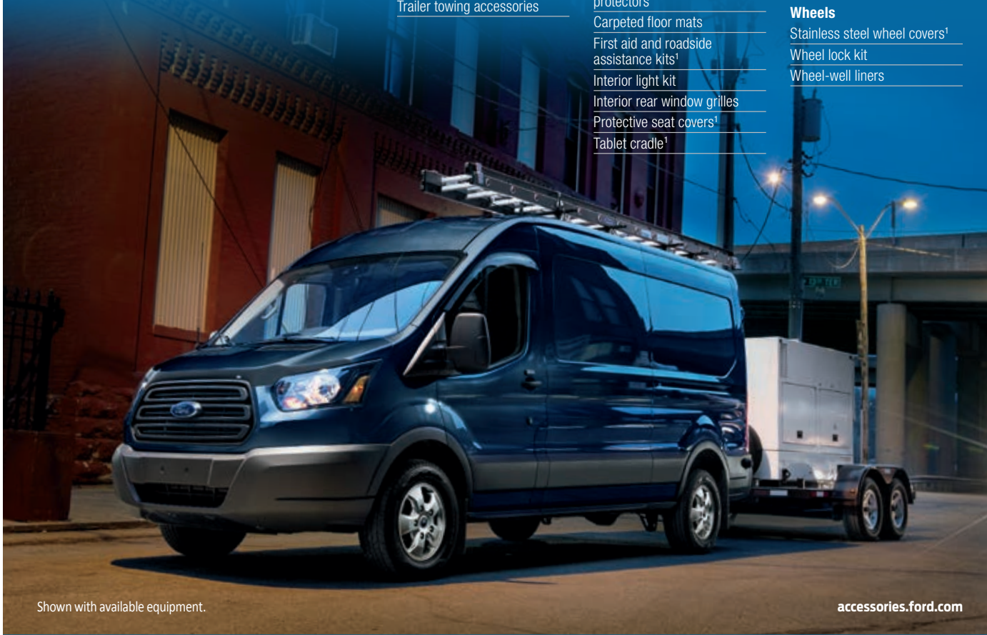
Shown with available equipment.