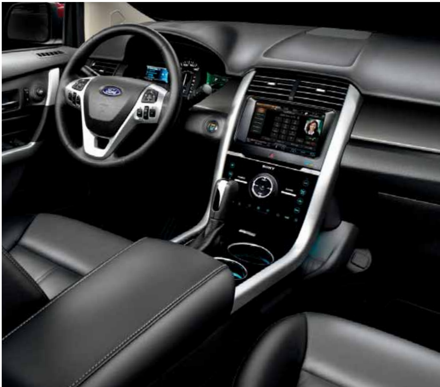
Charcoal Black leather trim. Available equipment. | Ambient lighting. | Chrome, oval exhaust tips. | Paddle shifters.