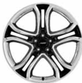
22" Polished Aluminum with Black Spoke Accents Standard