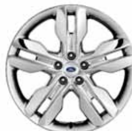
20" Chrome-Clad Aluminum Available on SEL