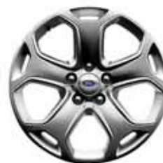
18" Painted Aluminum Standard on SEL