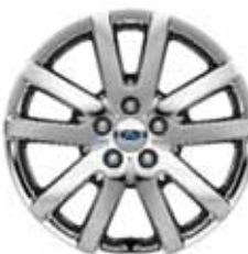
18" Chrome-Clad Aluminum Available on SEL