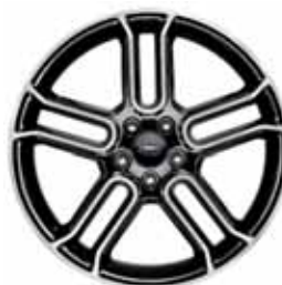
20" Machined Aluminum with Premium Painted Pockets Included with Titanium Appearance Package