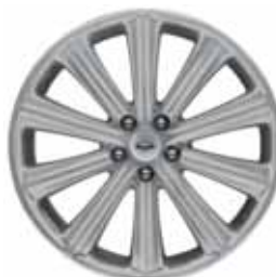
20" Polished Aluminum Optional on 300A and 301A, included with 302A and 303A