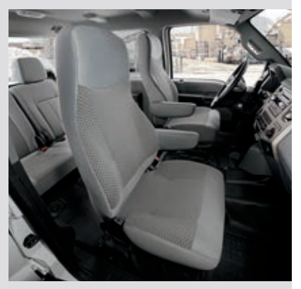
Standard 30/mini-console/30 driver and front-passenger bucket seats.