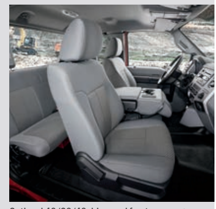
Optional 40/20/40 driver and front-passenger bucket seats.