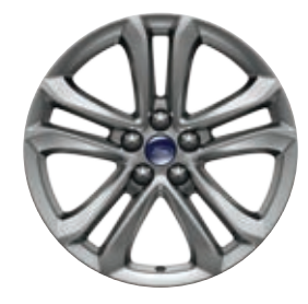
18" Polished Aluminum Available: SEL/Titanium (requires snow chain-compatible tires on Titanium)