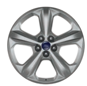
18" Sparkle Silver-Painted Aluminum Standard: SE