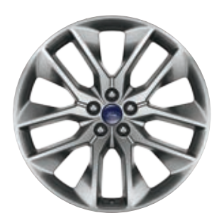
20" Bright-Machined Aluminum with Premium Dark Stainless-Painted Pockets Optional: Titanium