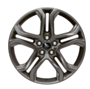
19" Premium Magnetic Metallic-Painted Aluminum Included: SEL Sport Appearance Package