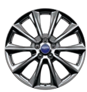
20" Premium Polished Aluminum Optional: Titanium<sup>1</sup>