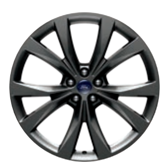
21" Premium Dark Tarnished Low Gloss-Painted Aluminum Optional: Sport