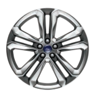
20" Polished Aluminum with Magnetic Low Gloss-Painted Pockets Standard: Sport