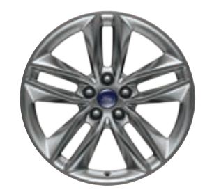
18" Sparkle-Silver Painted Split-Spoke Aluminum Standard: SEL