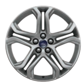
19" Nickel-Painted Aluminum Standard: Titanium