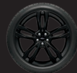
21" Premium Gloss Black-Painted Aluminum included in ST Performance Brake Package 3 Available