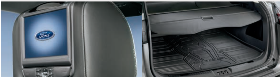
Rear Seat Entertainment System 1