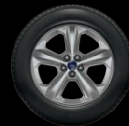
18" Sparkle Silver-Painted Aluminum Standard