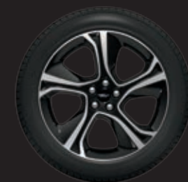
20" Bright-Machined Aluminum with High-Gloss Black-Painted Pockets Standard